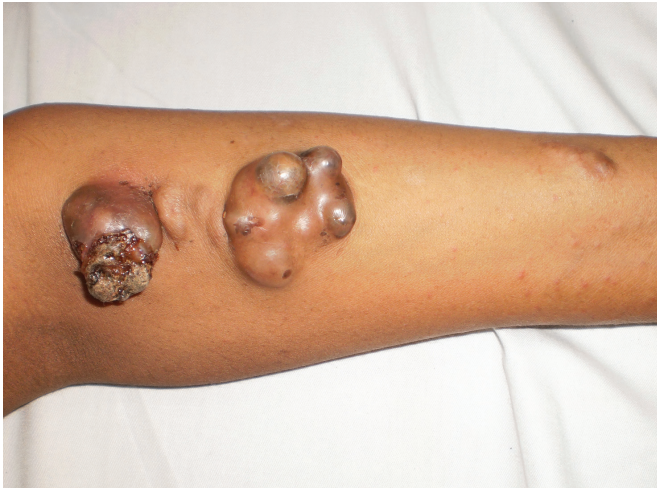
Figure 1. Giant Solitary nodular Trichoepithelioma of Forearm

stratified squamous epithelium underneath; there was a well-circumscribed tumor consisting of basophilic cells (Figure. 2). These cells were arranged in a lace-like pattern, occasionally forming a solid aggregate. These tumor islands showed peripheral palisading. There was presence of horn cysts of various sizes. The tumor was accompanied by hemorrhagic areas and was diagnosed as “trichoepithelioma.”