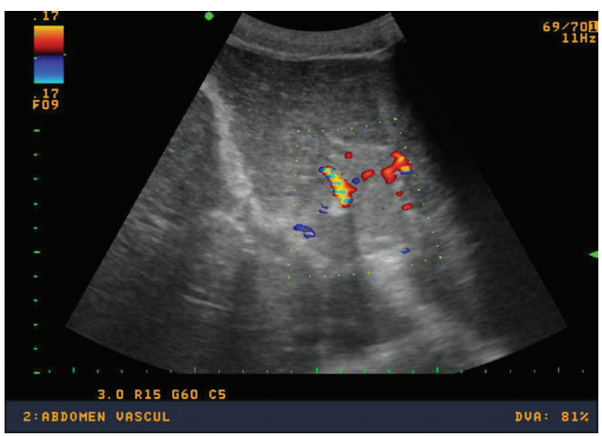
Figure 1. Color Doppler USG of liver showing thrombus filling the entire lumen of the portal vein with flow within the thrombus.

made into the thrombus, making sure that the needle was within the lumen of the portal vein at all times. This was done to avoid repeated punctures of the portal vein, thereby reducing any chance of bleeding. During FNAC, care was taken to avoid any injury to adjacent